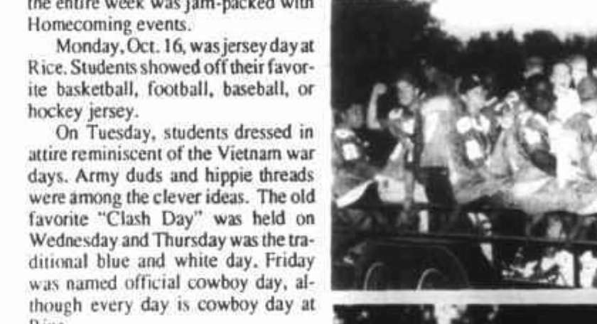
RHS homecoming parade

Rice High School hosted its annual Homecoming game on Friday, Oct. 20, against the Brookshire-Royal Falcons. In trying to boost spirit in the school and confidence in the players, the entire week was jam-packed with Homecoming events.